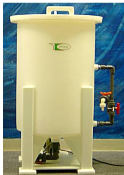
Complete line of jug fill mix tanks are available

Contact us today for more details at (518) 785-6800 www.qualitywatersolutions.com